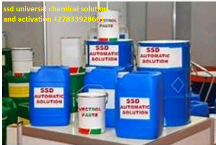
ssd universal chemical solution and activation +27833928661

Location Gauteng, Boksburg https://www.freeadsz.co.za/x-341960-z