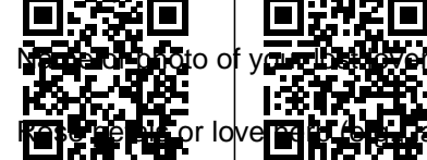
Photo of your lost lover Personal item or memory Quiet spiritual space