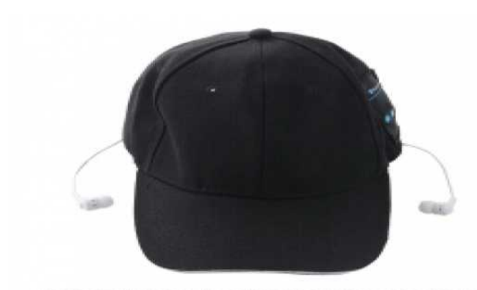
The product integrates the fashionable Sun-bonnet and Bluetooth Headset which is equipped with built-in speaker and microphone, supports hands-free function.