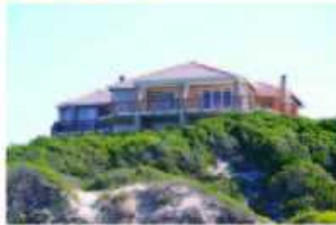
6 Bedroom Ocean View Beach House

Contact Details: artisticimpulse.wm@gmail.com 084 620 2020 Winnie Po.Box 26629 Monument Park 0105